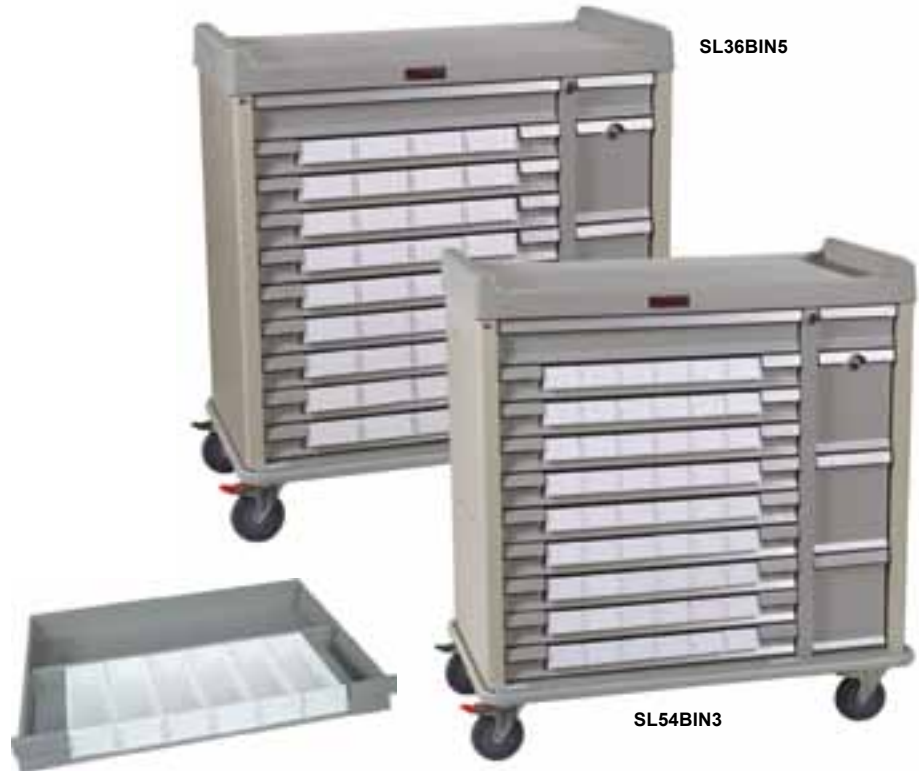
Bin dividers & labels included with each cart

SL42BIN3 (not shown) Standard Line Med-Bin Cart with a BEST® lock on cabinet, pull-out shelf. Capacity of 42 - 3.5" bins, Standard Package