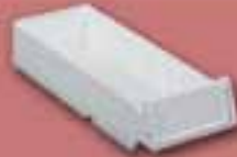
40446 Replacement 5" Bins 2.75"H x 5"W x 9.5"D