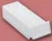
40442 Replacement 3.5" Bins 2.75"H x 3.5"W x 9.5"D