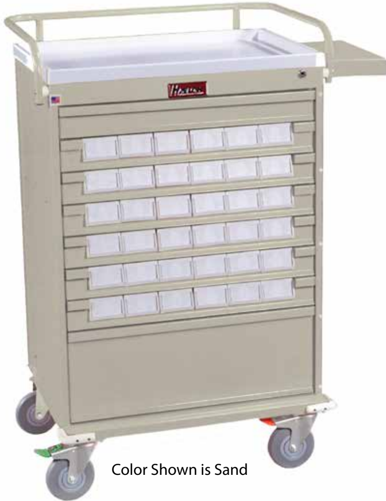
Color Shown is Sand

Harloff’s value medication carts offer many of the same features our customers love in our large med carts at an economical price point. This economy med cart has become our fastest growing small med cart.