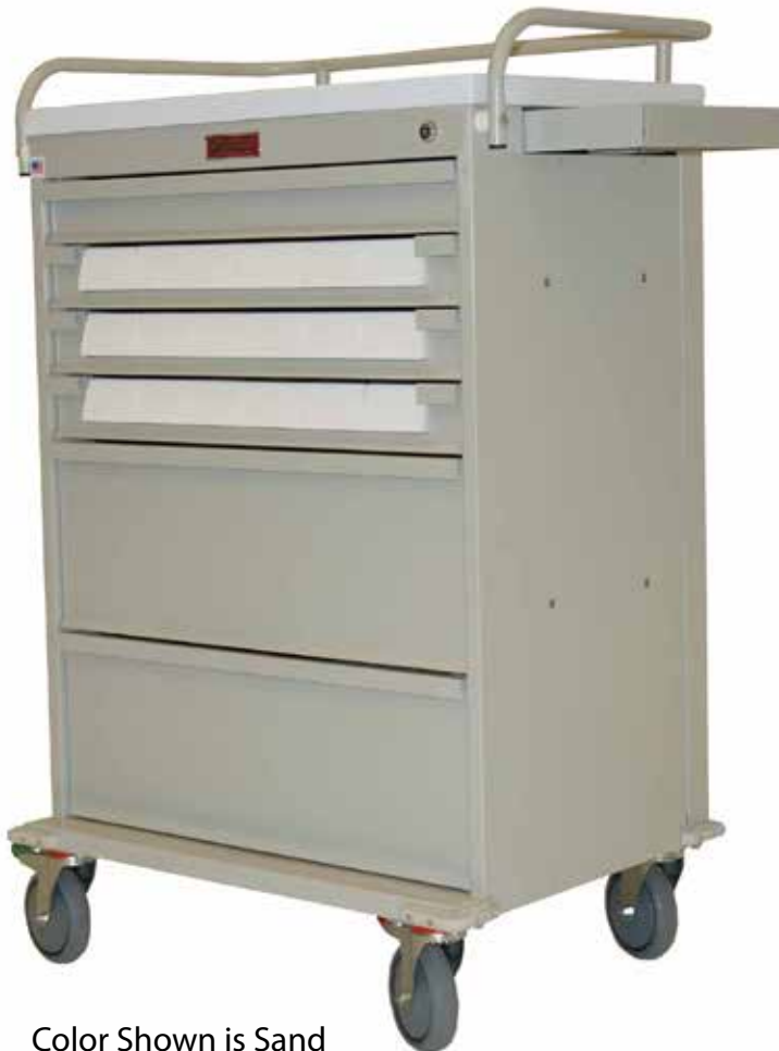
Color Shown is Sand