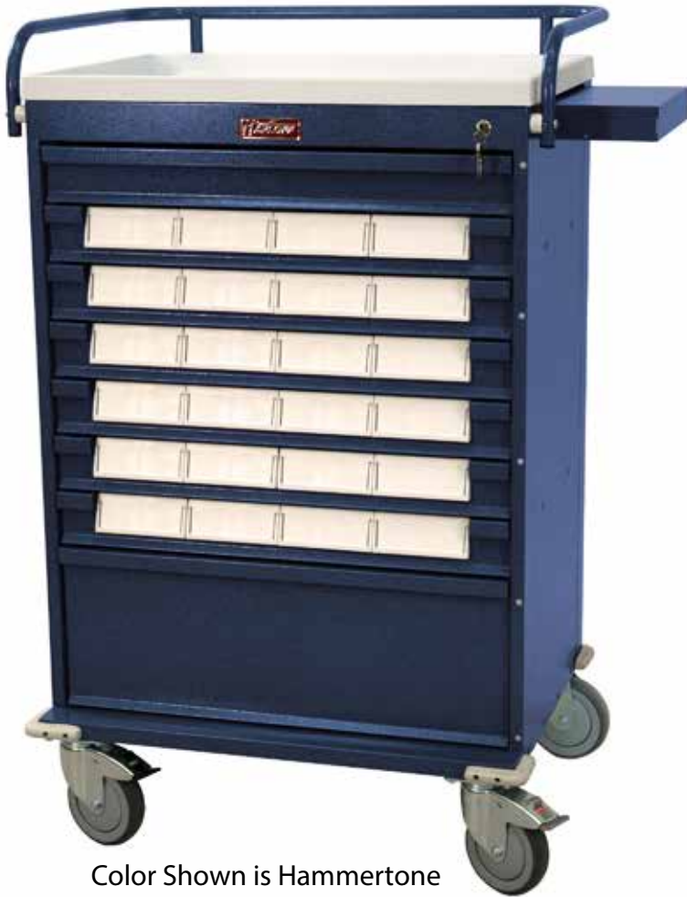
Color Shown is Hammertone Blue

Harloff's value medication carts offer many of the same features our customers love in our large med carts at an economical price point. This economy med cart has become our fastest growing small med cart.