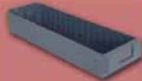
40433 Replacement 5.6" Extra Long Bins 2.75"H x 5.6"W x 18"D